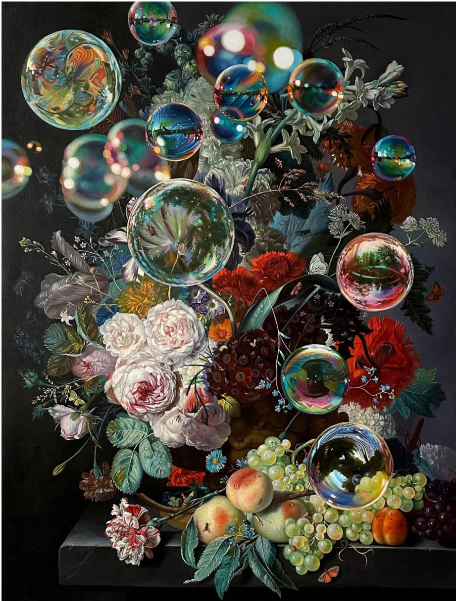
Marc Dennis Tradition , 2024 Oil on linen 46h x 35w in 116.84h x 88.90w cm