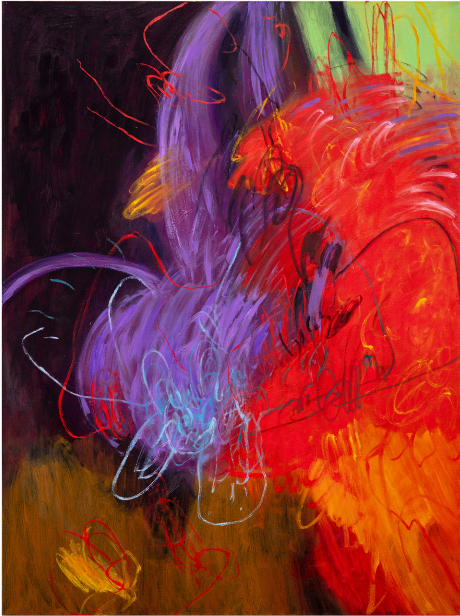
Wendi Men Paolo and Francesca , 2023 Oil on canvas 48h x 36w in 121.92h x 91.44w cm