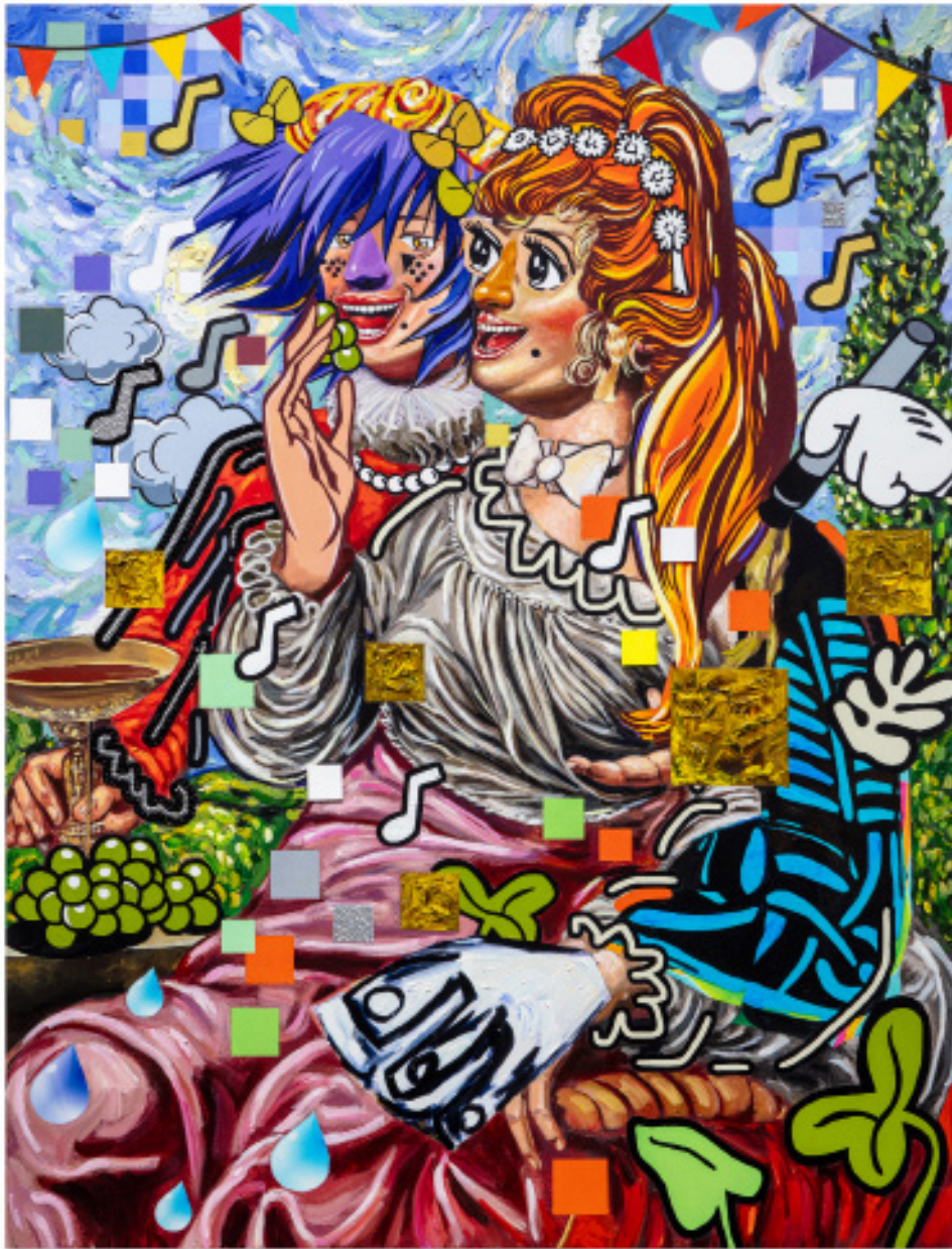
Allison Zuckerman Grape Eater , 2023 Oil, acrylic, crystal rhinestones, wood tiles, and archival inkjet print on canvas 72h x 55w in 182.88h x 139.70w cm