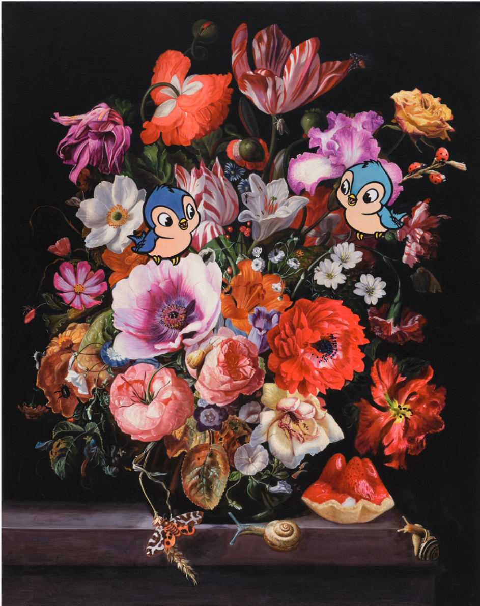
Marc Dennis Big Love , 2024 Oil on linen 40h x 31w in 101.60h x 78.74w cm