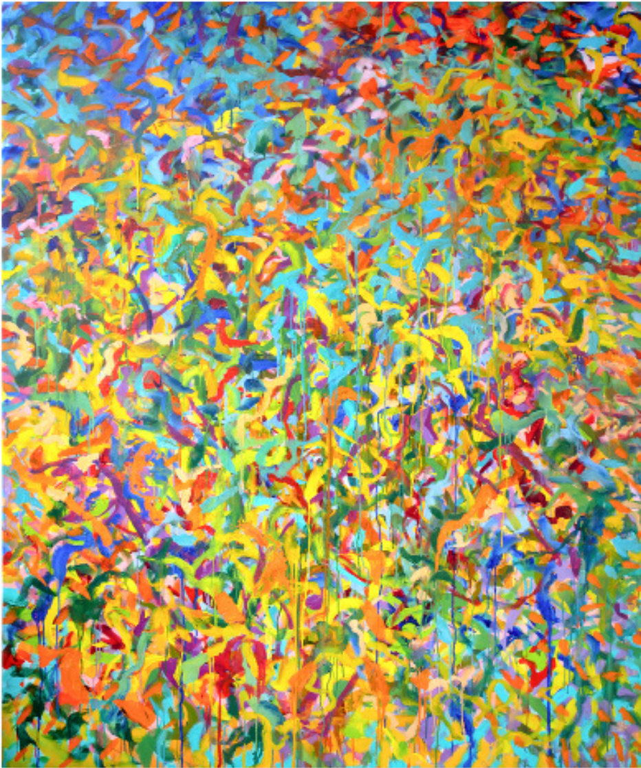
Shara Mays Addiline , 2023 Oil and acrylic on canvas 72h x 60w in 182.88h x 152.40w cm