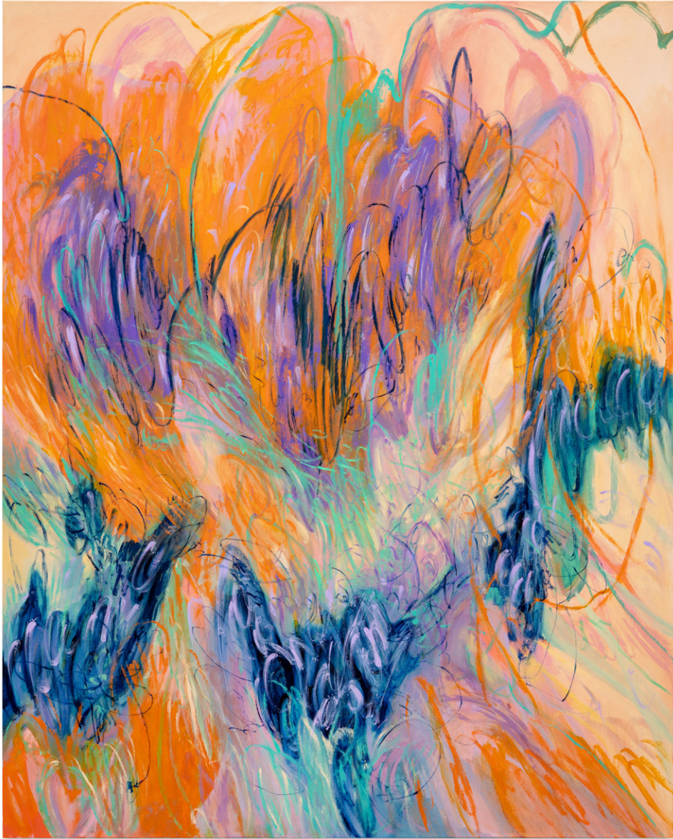
Wendi Men Rye Wave , 2023 Oil on canvas 60h x 48w in 152.40h x 121.92w cm