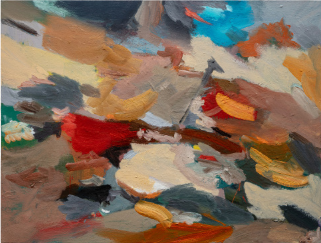
Demetrius Wilson Dazed in a Blur , 2024 Oil on canvas 36h x 48w in 91.44h x 121.92w cm