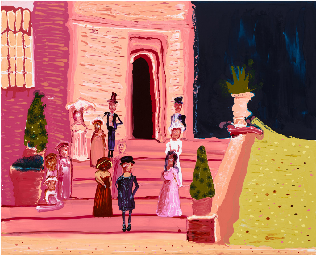
Genieve Figgis Summer House , 2023 Acrylic on canvas 47.25h x 59w in 120.02h x 149.86w cm